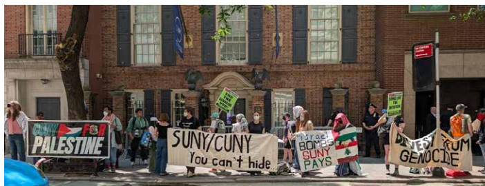
Demonstration for divestment outside SUNY Board of Trustees meeting, New York City, June 3, 2025.

At the end of the tribunal, organizers invited folks from the contingent to speak. This writer spoke as a representative of the contingent from the Buffalo community, addressing some of the ethical questions facing the students of today,