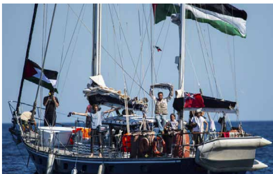
Crew and passengers of the Freedom Flotilla boat, the Madleen, prepare to set sail for Gaza. June 1, 2025, Catania, Italy.

The total support of U.S. imperialism for this forced starvation is confirmed, and not only by the military equipment and funding the U.S. has provided for over 75 years. It was