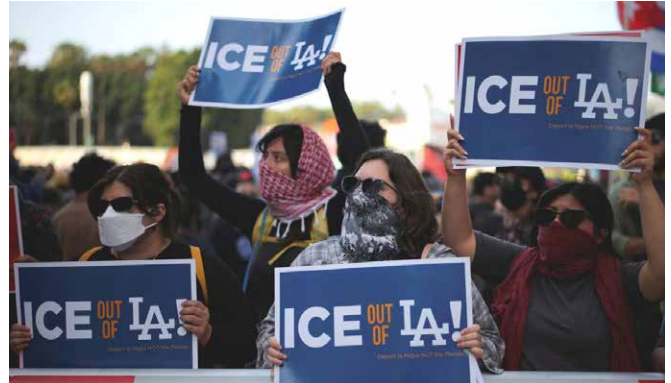
Los Angeles protest, June 8, 2025.