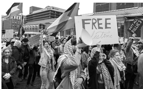
Philadelphia, April 5, 2025.

Protest reports can be read at workers.org/2025/04/84908/