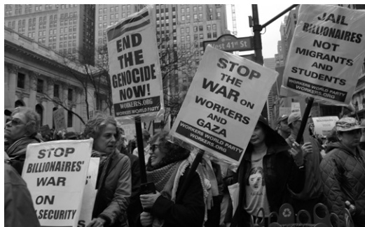
New York City, April 5, 2025.

Nearly everyone in the U.S. has been negatively affected by the Trump/Musk team's cuts to federal jobs, veterans' care, schools, libraries, science programs, Medicaid, the Women, Infants and Children program, heating aid, the Supplemental Nutrition Assistance Program and more. There are looming threats to Social Security and disability benefits. The capitalist class is trying to crush the working class and take the wealth it has produced.