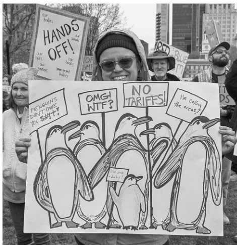
Philadelphia, April 5, 2025.

The fear among capitalists now is that the added cost of new, huge tariffs imposed by Trump will eat into their profit margins.