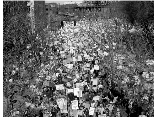
Portland, Oregon, April 5, 2025.