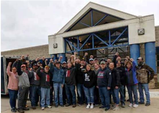
John Deere strikers in Waterloo, Iowa, with supporters from Retail, Wholesale and Department Store Union who brought food and supplies Oct. 29.

Recent strikes pose a threat to both capital and conciliatory labor leaders. How the Deere strikers vote will be an important indicator of how hard workers are willing to fight to retain and win back lost gains and block further contract concessions. □