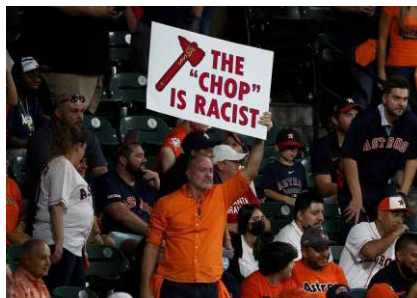
Game 1 of the World Series in Houston’s Minute Maid Park, Oct. 26.