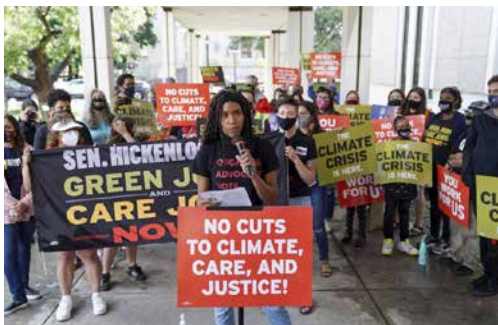
People demand a full program.

Building the “hard infrastructure” — highways, bridges, railroads, water mains, etc. — aids the capitalist system. Even Republicans appeared to support this part of the program,