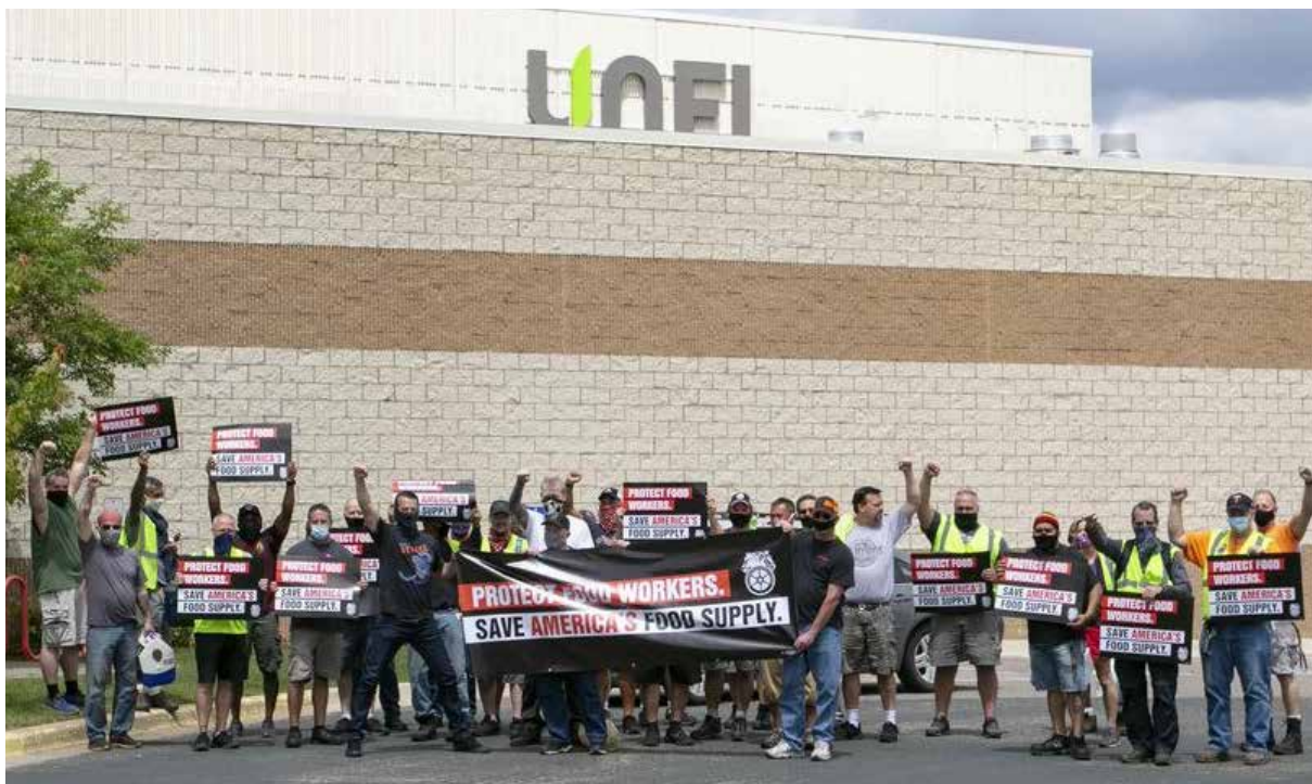
Teamster members protest working conditions outside the UNFI warehouse in Denver, Colo., June 10, 2020.

Just imagine the impact if all 3.5 million truck drivers in the U.S. not only followed the Teamsters' example by protesting but withheld their labor to win their demands. For that to happen nonunion drivers have to organize. □