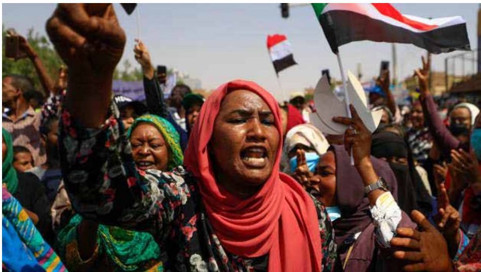
Sudanese demand civilian rule, Khartoum, Oct. 21.

The U.S. has focused on destabilizing and dividing Sudan, with more than 30 years of U.S. sanctions that have strangled the country. In 1998 a U.S. missile attack destroyed Sudan's only pharmaceutical plant; and there have been years of Israeli bombardment of Sudan with U.S. backing. U.S. efforts to partition the country include backing various separatist breakaway attempts, like in Darfur in west Sudan, not to mention the U.S. role in the Peace Agreement of 2005 between Sudan and South Sudan and immediate