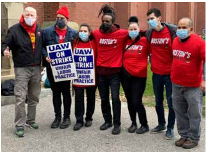
Striking Harvard graduate students with supporters from UNITE-HERE Local 26, which represents Harvard dining hall workers.

Strikers’ tactics included picketing classes, stopping trucks from making deliveries, disrupting the presidents’ speeches and leading classroom walkouts. Harvard management refused to negotiate Oct. 28, saying that they did not like the tactics of the union — so HGSU increased their tactics.