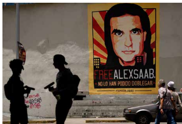
In Caracas, Venezuela, there are many expressions of public support for diplomat Alex Saab, who was working to end the U.S. blockade of his country.

Fifth, charges levied against Ambassador Saab involve his circumventing U.S. unilateral coercive economic sanctions waged against the Venezuelan people — which are illegal under both