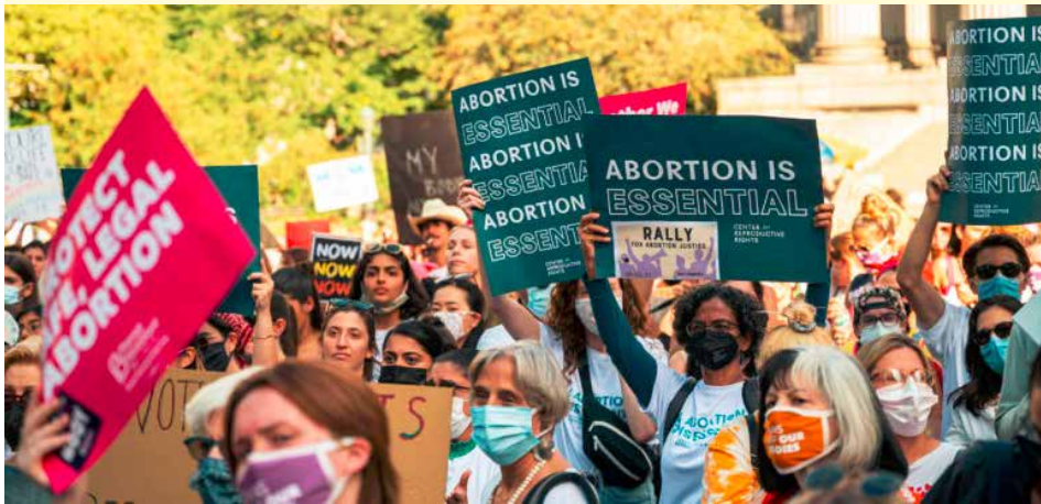
Nov. 1, Washington, D.C.

All progressive forces should join the protests outside SCOTUS called for Dec. 1. This is a crucial action. Between now and then and beyond, local actions should be organized. It is time to mobilize! March! Rally! Resist! Boycott! Sit-in! □