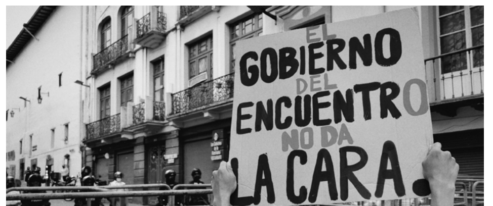
New uprising in Ecuador began Oct. 26. A sign reads 'The government of dialogue doesn't show its face.'

Oct. 28 — On Oct. 26, a progressive mobilization of the population to resist the government's neoliberal program began nationwide in Ecuador. The protest that spread throughout the country has generated much hope that the people will gradually consolidate enough power to build an effective anti-neoliberal