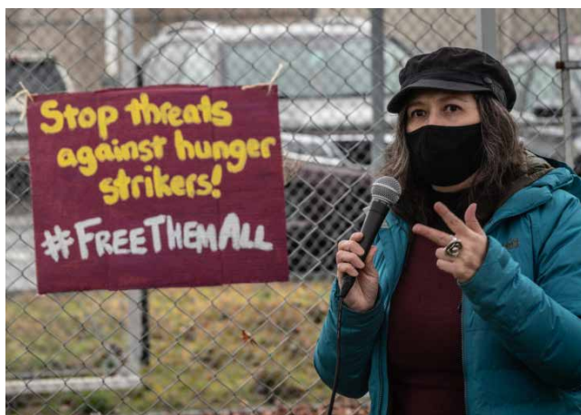
Incarcerated workers on strike against horrific conditions at the Northwest Detention Center were supported by La Resistencia, Dec. 15, 2020.

from a lawsuit filed by Washington State Attorney General Bob Ferguson. In a separate lawsuit, on Oct. 29 a jury awarded $17.3 million in lost wages to all prisoners detained since 2014 in the Northwest