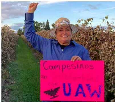
La Unión de Campesinos en solidaridad con la huelga en John Deere.