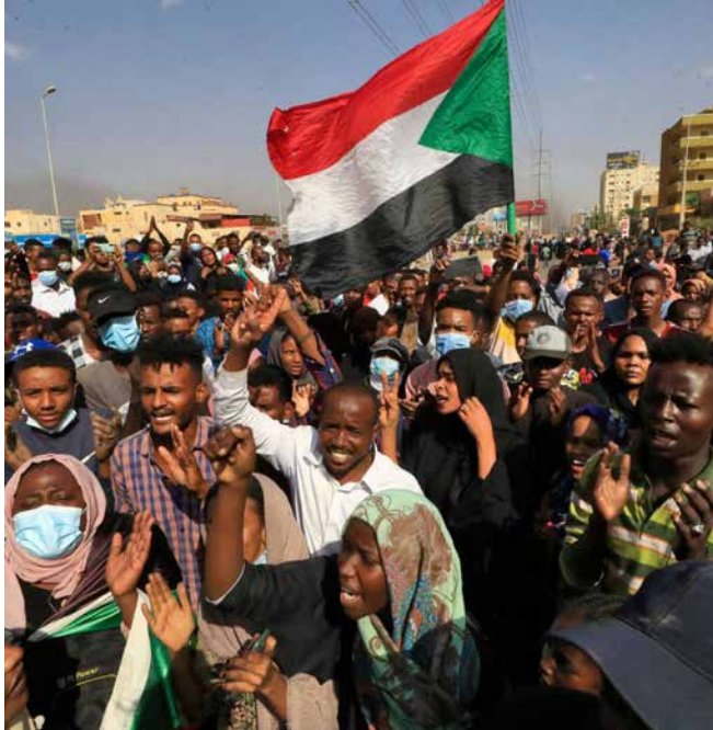
Sudanese coup protest in the capital, Khartoum, Oct. 25.

Coup leader Burhan has declared himself head of the Sovereign Council, a power-sharing body of military officers and civilians, which has been ruling Sudan since late 2019. Prime Minister Abdullah Hamdok, head of the moderate civilian faction of that transitional government, has been arrested, along with most civilian cabinet members and other leaders.