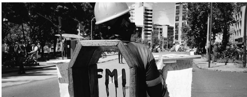
Demonstration last year against the neoliberal Ecuadorian government.