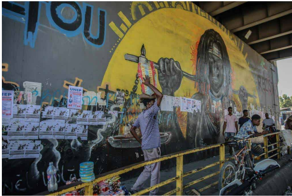
Oct. 18, mural, signs in Haiti call for general strike.

These groups have a history of being paid, armed and directed by the government, politicians of all sorts and businesses. Now, however, under the pressure