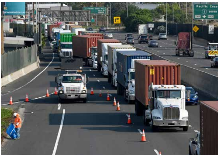
Los camiones esperan para entrar en el puerto de Long Beach para recoger cargas, octubre de 2021.

En su afán por maximizar los beneficios, las corporaciones multinacionales empezaron a exportar aparatos de producción, trasladando fábricas enteras de un país a otro para encontrar dónde podían pagar a los trabajadores los salarios más bajos. Estas mismas corporaciones obligaron a los fabricantes de piezas a competir entre sí para ofrecer