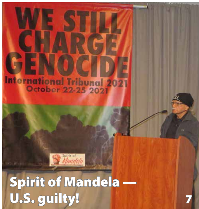
Oscar López Rivera, Puerto Rican freedom fighter and former political prisoner, testifies Oct. 23.