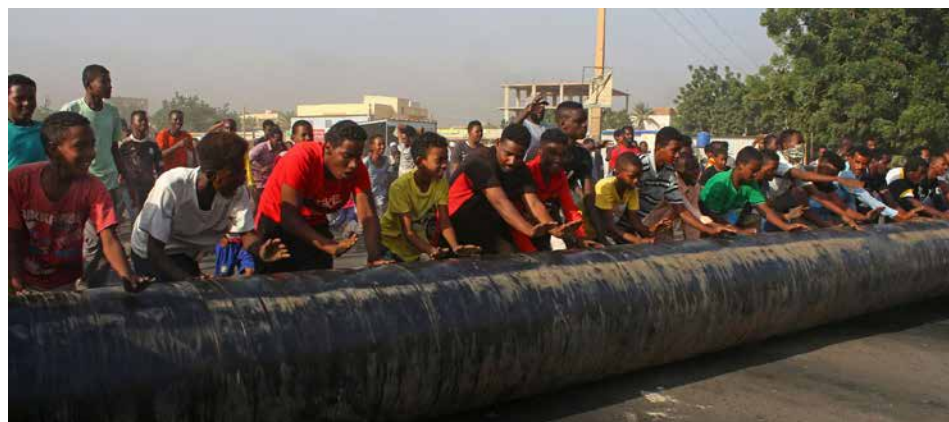
Barricade at coup protest, Khartoum, Oct. 25.

The power of working-class organizations to unify and organize millions of workers, peasants and oppressed nationalities to defend their own interests against these exploitative deals and military coups is the way forward. □