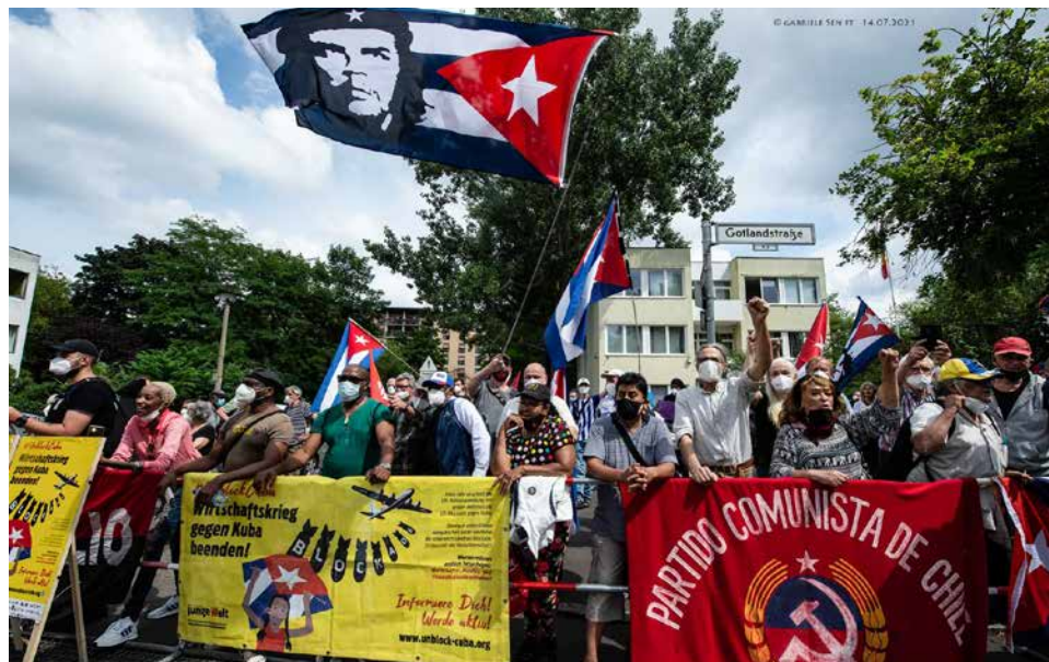
Anti-imperialists worldwide held demonstrations supporting the Cuban government. Above, Berlin. Sign in German reads ‘Stop the economic war against Cuba.’