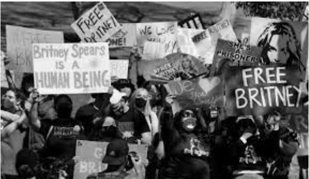
Many Britney Spears fans support her court challenge.

Goldman Sachs reports that the total value of the