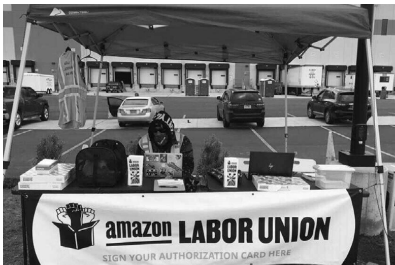
Chris Smalls organizes for the Amazon Labor Union outside Amazon's Staten Island facility.