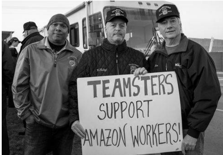
Nov. 19, 2019, New York City.

These questions are for every union, every worker — whether they're in a union