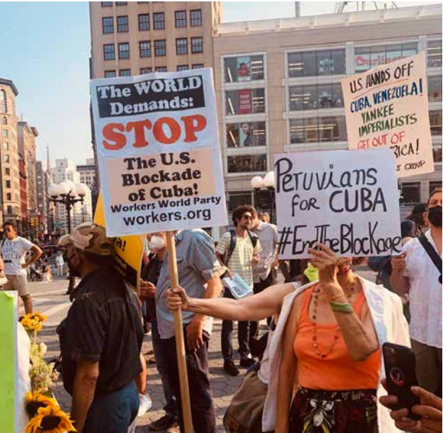
Union Square, New York City, July 15.

“As I said in my closing speech at the Party Congress, we revolutionaries defend the Revolution above all else, we communists on the front lines; and with that conviction we are now in the streets — we are not going to allow anyone to manipulate our situation or defend a plan that is not Cuban, that is not for the welfare of Cubans and that is annexationist. This is the task to which we call revolutionaries and communists of this country,” he concluded. □