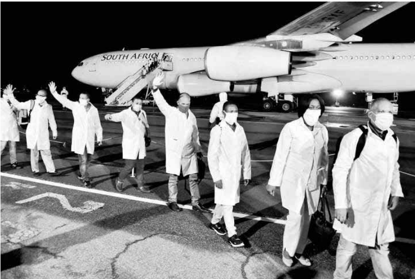
Cuban medical team arrives to deliver aid and solidarity to South Africa during the pandemic.

We know you read WW/MO for class truth, free from corporate lies and geared to working and oppressed people. We need your help! Join the WW Supporter Program, initiated 44 years ago, to aid in funding the newspaper.