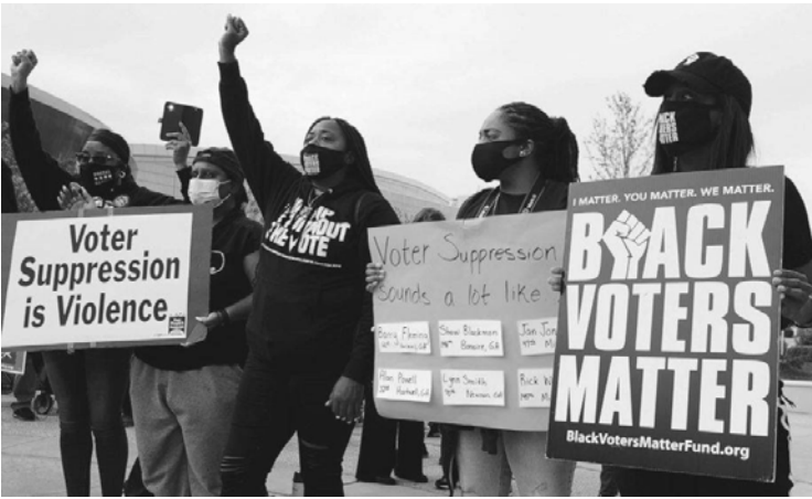
Rally at World Of Coca-Cola Museum, Atlanta, March 15.

There has been an internal struggle within the Texas Legislature between right-wing Republicans and mainly African American and Latinx Democrats over these repressive measures. In fact, a delegation of these Democrats left Texas in an effort to stall the vote. They plan to hold a weeklong virtual press conference beginning July 19 with support from the Service Employees International Union and Mi Familia Vota, which promotes Latinx voting rights. Republicans have threatened to have their Democratic counterparts arrested upon their return to the state. These repressive bills are now being debated in 43 out of 50 states in the U.S. That begs this question: Why haven't the Democrats called for a national demonstration to defend the right to vote, since their main social base is Black, Latinx and other disenfranchised sectors of society? Even with the pandemic still a factor, the unions — upon which the Democrats rely for votes — could still