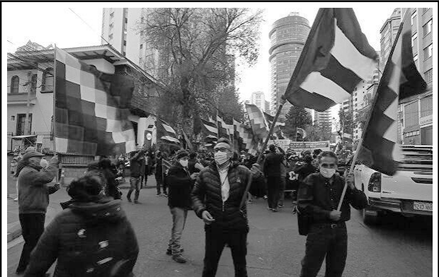
Demonstrations were held worldwide in solidarity with Cuba. This one, in La Paz, Bolivia, cheers on the Cuban Revolution from a country where the mass movement reversed an October 2019 reactionary coup.

Health conditions and medical care in Haiti have been in dire straits during the pandemic. Haitians received