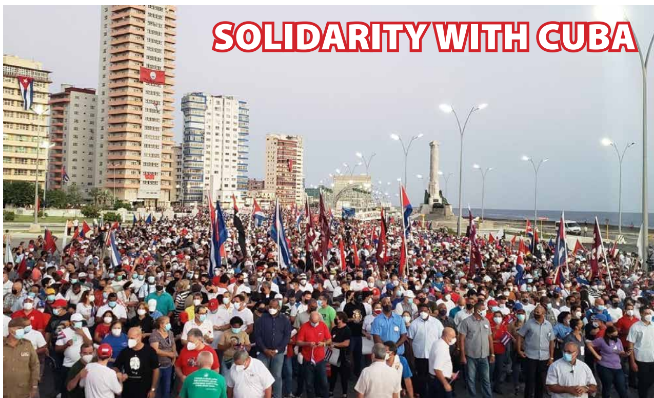
U.S. corporate media withheld photos showing popular support for Cuban socialism on the island — or falsely reported them as anti-government demonstrations.