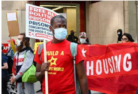
MO FOTO: JOE PIETTE

Cuando finalmente escuché un podcast con marxistas-leninistas que desacreditaban a fondo muchas de las medias verdades y mentiras sobre Stalin y la URSS, esto jugó un papel fundamental para convertirme en un revolucionario, y me empujó a leer más sobre la historia de la URSS. Otras interacciones con camaradas de Workers