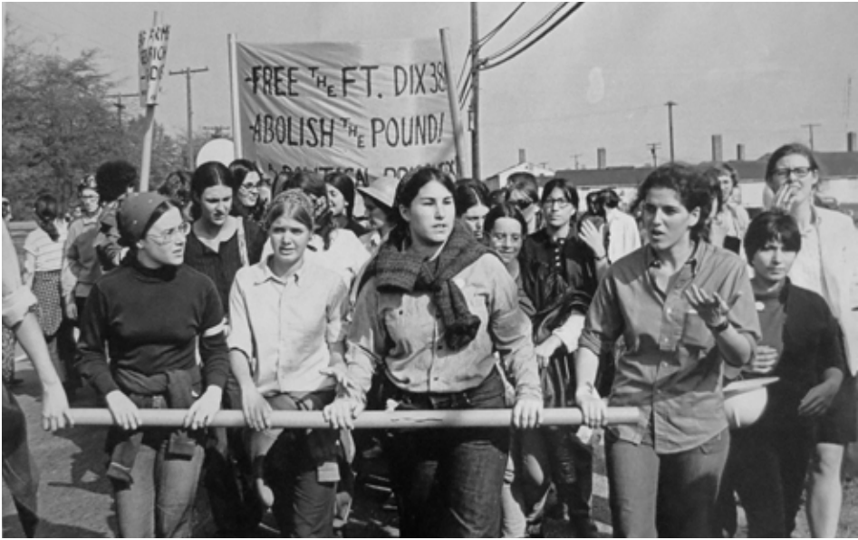
Women in anti-imperialist organizations took the leadership of the march on Fort Dix to demand freedom for soldiers who rebelled inside the stockade.