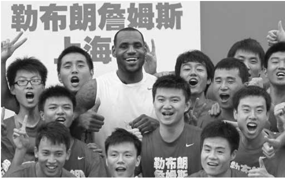
LeBron James, Los Angeles Lakers forward, in China.

Morey’s tweet, suggesting that Hong Kong, a strategic center of global finance capital, should break away from mainland China, is blatant interference into the country’s internal affairs. Yet the U.S. would be up in arms if, for example,