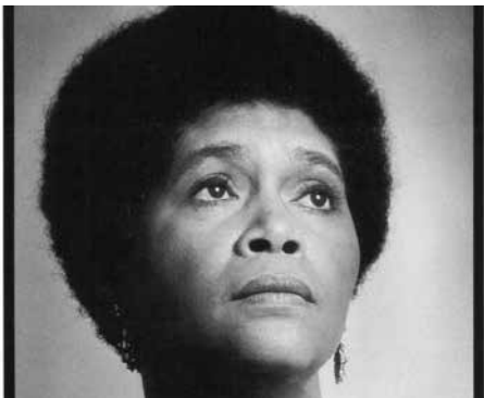
From the cover of the album, “Spirituals.”