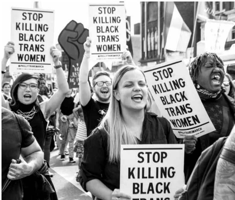
Philly Trans March 2019, Oct. 12.

At a rally in Malcolm X Park preceding the march, organizers explained that they chose the community setting to drive home the point that many trans women were murdered and attacked when they were coming or going to work or coming home after an evening out. Speakers strongly appealed to the community to resist this violence and defend Black trans women, and they denounced legislative and judicial efforts to restrict and