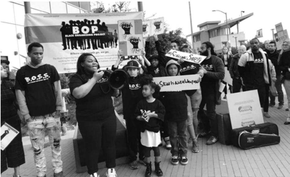
Black Organizing Protest protest, Nov. 13.

According to the 11-page People’s Plan, the police have historically profiled and arrested a disproportionate number of Black students in the schools. BOP is calling for the school district to set up a real “sanctuary district” to protect Black and Brown young people in the schools.