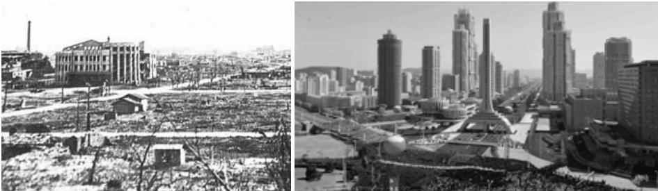
Pyongyang, capital of DPRK, leveled to the ground by U.S. bombs during Korean War (left); Modern day Pyongyang due to socialist reconstruction (right).