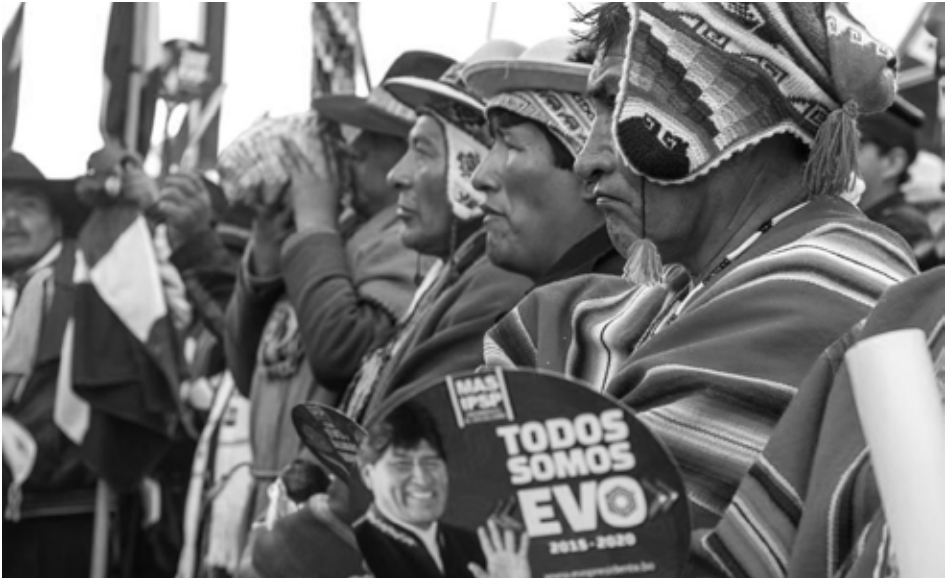
La Paz, Bolivia, 29 de octubre.

En consecuencia la resistencia que se está organizando ante el golpe, además de defender los derechos de los pueblos originarios, representa la lucha de clases y la oportunidad de crear una nueva fuerza pública fuera del control de la oligarquía. Por lo tanto, esta lucha merece el apoyo de la clase obrera de todo el mundo, así como de todos los antirracistas. □