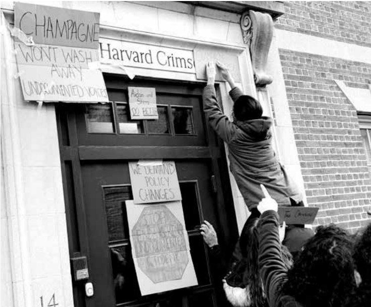
Middle of door sign reads “Stop endangering undocumented students.”

Four workers representing the Harvard TPS Coalition