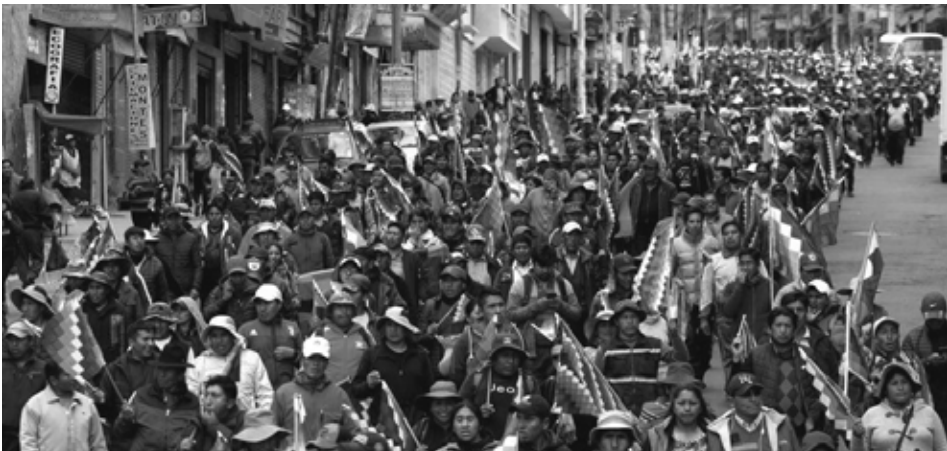
Cada día hay una manifestación desde El Alto hasta La Paz. La resistencia sigue.

En la ciudad de El Alto, cercana a la capital administrativa de La Paz y famosa por su historia de derrocar dictadores, los habitantes, en su mayoría indígenas, forzaron