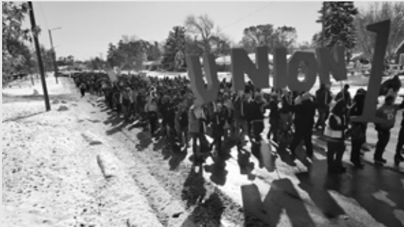
PHOTO: FIGHT FOR $15 Detroit McDonald’s workers, supporters march Nov. 12.

Close to 1,000 McDonald’s and other fast food workers and supporters held a noisy march and blocked traffic in Detroit Nov. 12. They called for an end to sexual harassment, $15 an hour pay and “unions for all.” The action was part of an international “McStrike” of low-wage workers in selected cities in Brazil, Chile, Canada, Belgium, France, England, Germany and the U.S. Congresswoman Rashida Tlaib spoke at the Detroit action, saying, “Corporate greed is a disease in this country and you are going to stop it. When you walk out they lose money. ... If there is a place to start this movement it is the city of Detroit.” (fightfor15.org) Jenna Ries, a plaintiff in a class action lawsuit over sexual harassment at McDonald’s in Mason, Mich. also spoke. Her store manager repeatedly made sexist comments and eventually sexually assaulted her. “Sexual harassment is unacceptable” was the message on a large lead banner in Spanish.