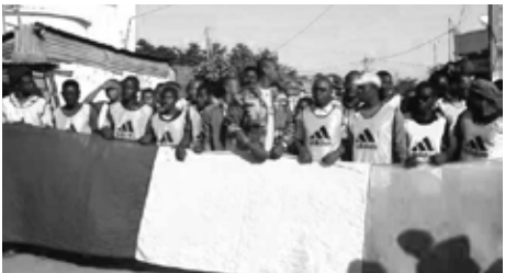
People in Bamako, Mali, in solidarity with Yellow Vest movement, Dec. 2018.

Yellow Vest people employed some innovative tactics. In eastern Paris, together with delegations from Extinction Rebellion, a Queer activist coalition, immigrant rights activists, housing activists,