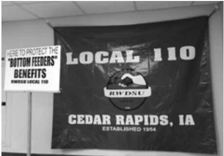
RWDSU banner

A tentative contract agreement was reached Nov. 8. The worker-led negotiating committee “worked tirelessly to secure a strong contract that stops the bleed out of long-held needed benefits,” according to a RWDSU press statement, and recommended the workers vote in favor of it. The new three-year contract was ratified Nov. 14. In addition to annual hourly wage