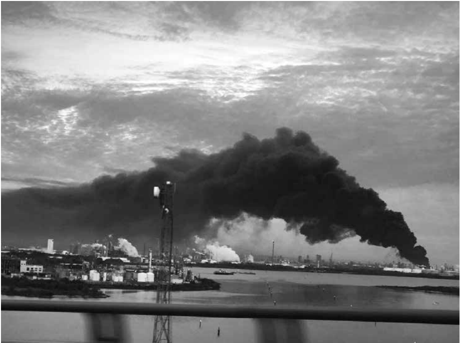
Toxic “tank farm” fire still burning in Houston on March 22.

behind the Texas Attorney General’s filing a lawsuit against ITC this week, accusing the company of violating clean-air laws. Decades of activism against pollution For decades activists from the Texas Environmental Justice Advocacy Services (t.e.j.a.s.) have fought the polluting refineries on the east side of Houston. Those communities in Texas Congressional District 29 (CD 29) surround the Houston Ship Channel, home to the largest petrochemical refinery complex in the Western Hemisphere. The lack of safety in these industrial facilities has subjected residents to uncontainable toxic pollution. According to t.e.j.a.s., “Houston ranks 1st in the U.S. for mercury, formaldehyde, benzene, 1-3 butadiene and a host of other toxic chemicals in the air. Texas ranks 1st in the country for carbon dioxide emissions, cancer-causing chemicals released into the air, toxic chemicals released into water, hazardous waste generated, and much more undocumented pollution. ... Despite record profits, record pollution, record sickness, and minutes away from the largest medical center in the world, Texas CD 29 has more uninsured children than any district in the country.” □ Next: Town meetings expose community health crisis in Houston.