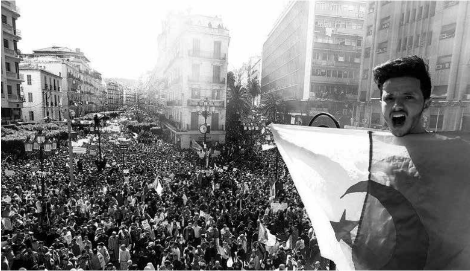
Anti-government protest in Algiers on March 15.

The Algerian people are conscious of their revolutionary history, and they are in the streets demanding not just the resignation of President Bouteflika but real changes in the system. □