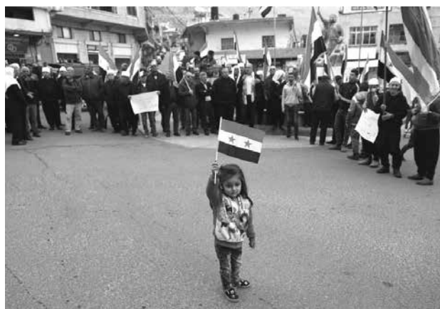
A child holds a Syrian flag at a rally in the village of Madjal Shams, in Israeli-occupied Syrian Golan, March 23.

On Dec. 14, 1981, Israel declared that it had annexed Syrian Golan. Three days later the United Nations Security Council unanimously (including the U.S.) adopted Resolution 497 which declared the annexation "null and void and without international legal effect." For this reason alone (and there are others), the Trump administration's