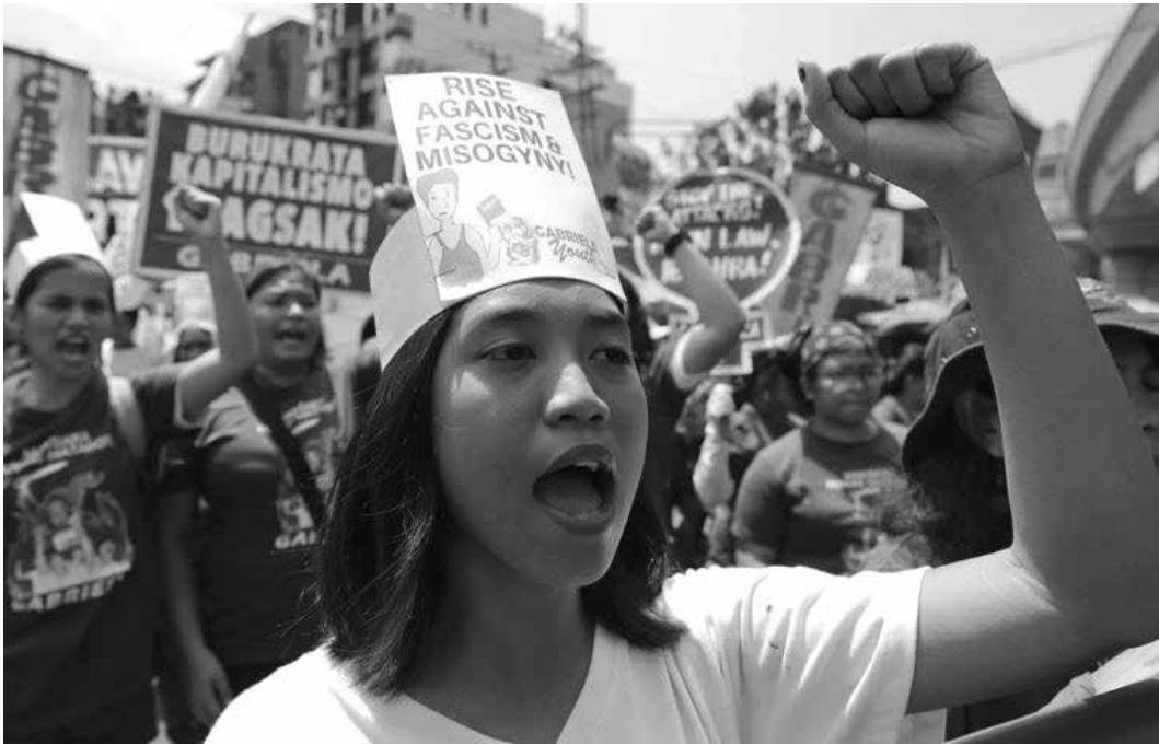
International Women's Day on March 8 was marked by global actions, strikes and protests, including in the Philippines, above. More on 6-7.

past decades. There is an immediate threat of military dictatorships again dominating the people of Latin America. And if the U.S. gets its hands on Venezuela’s immense oil wealth, the U.S. will assume functional control over the vast majority of the world’s oil. But with all our strength, we are fighting back! From solidarity delegations to flash pickets and mass mobilizations, we are gaining momentum. Activists and peace-loving people are converging on Washington, D.C., on March 30. We will meet in front of the White House at 1 p.m. EST to tell Donald Trump, his generals and his financial crooks that the people of the world are sick of racist and imperialist institutions like NATO. NoWarOnVenezuela.org