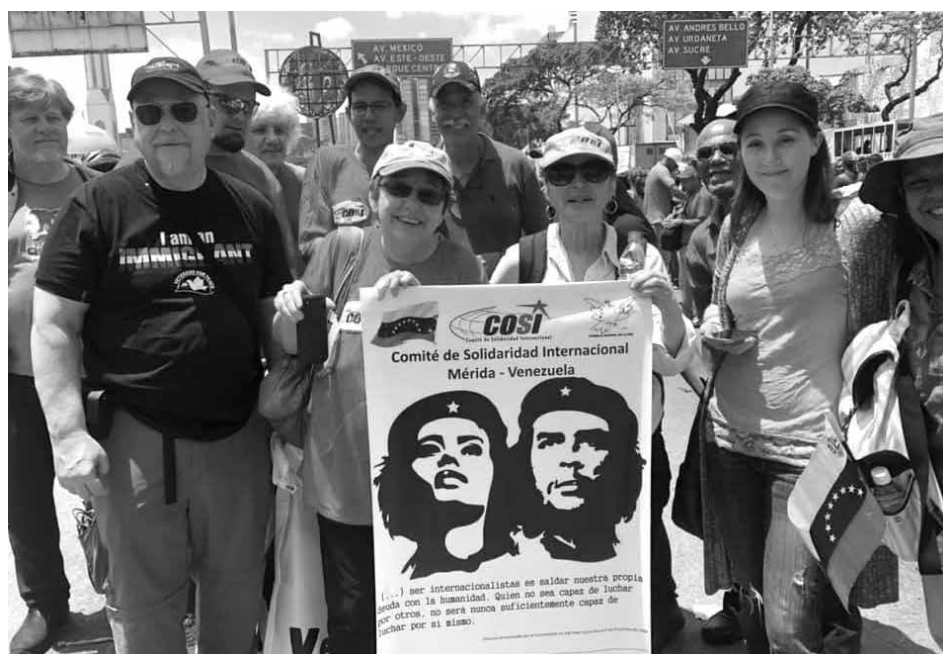
Some members of the U.S. Peace Council solidarity delegation supporting Bolivarian Venezuela, in Caracas, March 19.

Every day the battle lines become clearer and the social movements of the Americas take their position. When the struggle between imperialism and the popular masses is as sharp and as widespread as it has now become, there are only two paths left: a return to the brutal military dictatorships of the 20th century or the liberation of the entire American continent, just as Bolívar once hoped. □