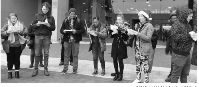
Singing rewritten carols outside Cleveland "Justice Center" after being kicked out for showing solidarity with county jail inmates. Cleveland, Dec. 16.

The county administration has made some improvements due to public pressure and negative media publicity, but serious rights violations are ongoing. □