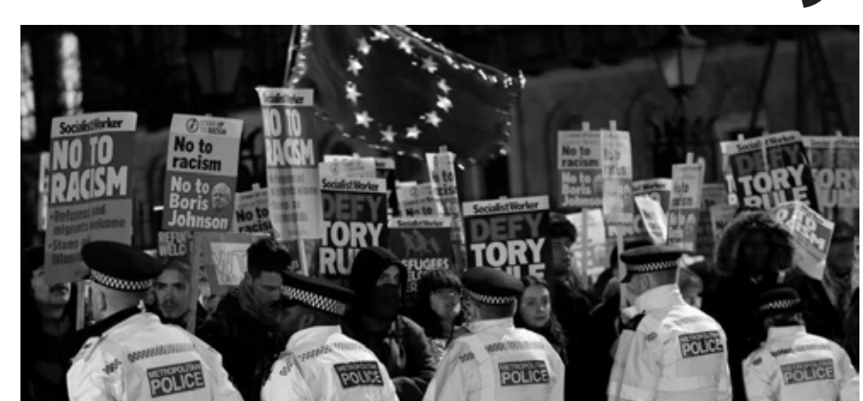
London protesters face down police after the Dec. 12 election. Some were arrested.

The prime minister has made more blatantly racist comments, even employing racist slurs against Black people. The pro-Tory vote, like the pro-Brexit vote three years ago, is a racist vote. Whatever the various reasons for working-class voters to hate the EU, overlooking racism is itself