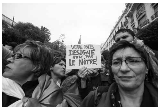
Dec. 12 protest.

All the candidates that were vetted by the electoral commission were close collaborators — ministers and