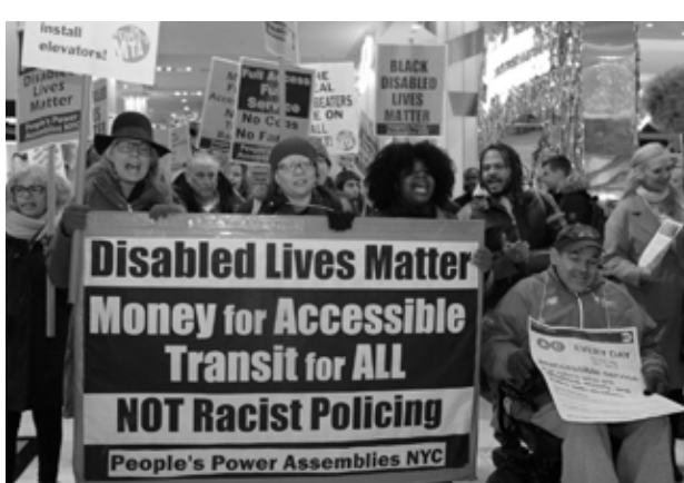
Dec. 3, inside Macy's.

Speakers at Herald Square — New York's busiest holiday shopping center — included disabled activists from Disabled in Action, Jews for Racial and Economic Justice, Communications Workers Local 1180 Committee on People with Disabilities, People's Power Assemblies/NYC,