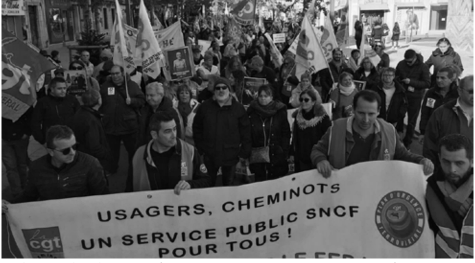
Workers march in the streets of Draguignan, Dec. 10, to say no to pension reform.

The French Democratic Labor Confederation (CFDT), which is the largest labor confederation in the private sector, had firmly supported the way the government proposed restructuring the retirement system. Yet what it can't support are government plans to make workers stay on the job years longer to get a full pension. So on Dec. 11 the CFDT