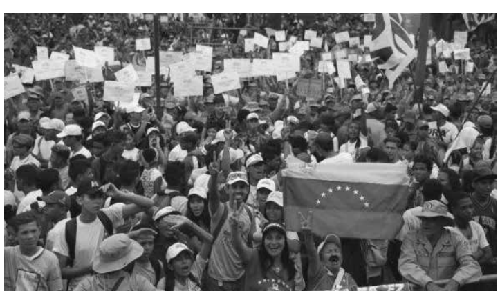
Protesta en Caracas, Venezuela defiende al gobierno pro Morales en Bolivia, 30 de marzo de 2019.

Todas estas ventajas se utilizaron durante la reciente lucha en Bolivia, que