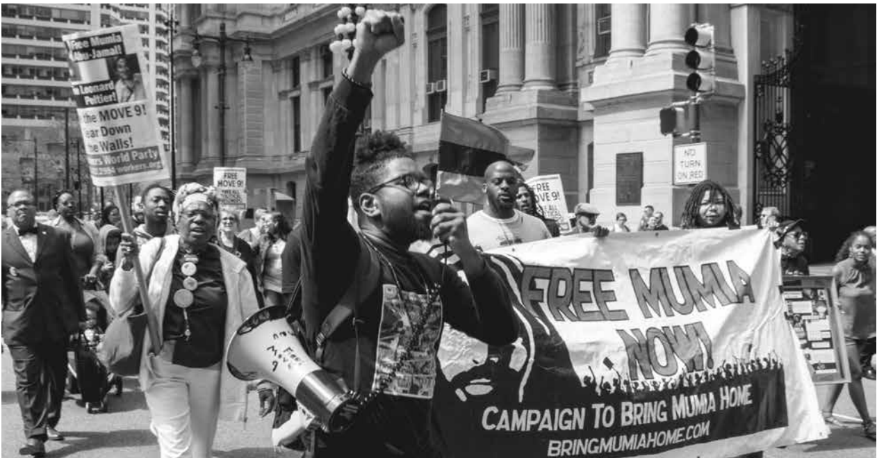
April 18 march for Mumia in Philadelphia.