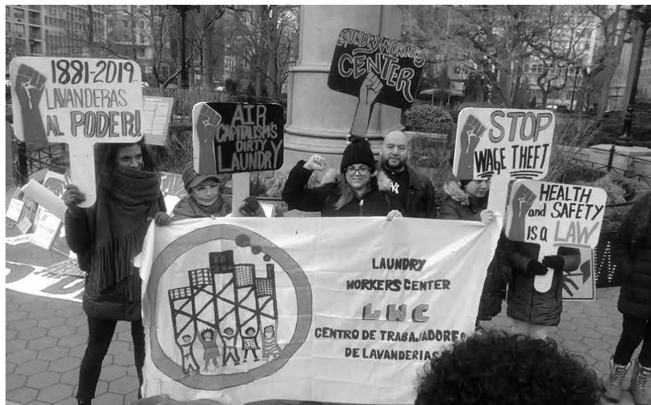
March 8, 2019

In 2019, Cleveland May Day will commemorate the people and events of 100 years ago. As the Committee for 100 Years explains, “The issues being protested 100 years ago are still deeply relevant today: for justice in immigration, in opposition to war and police brutality, and against capitalism.” □