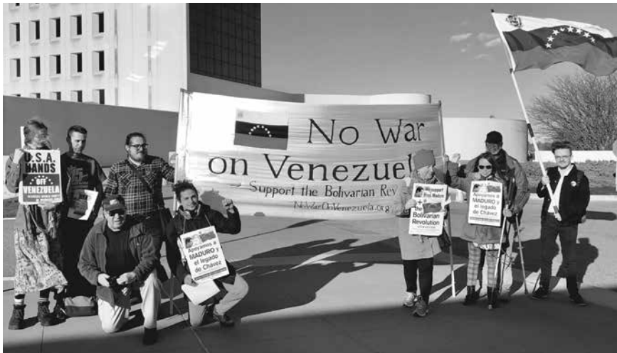
Protesters gather in front of JFK Library, April 16.