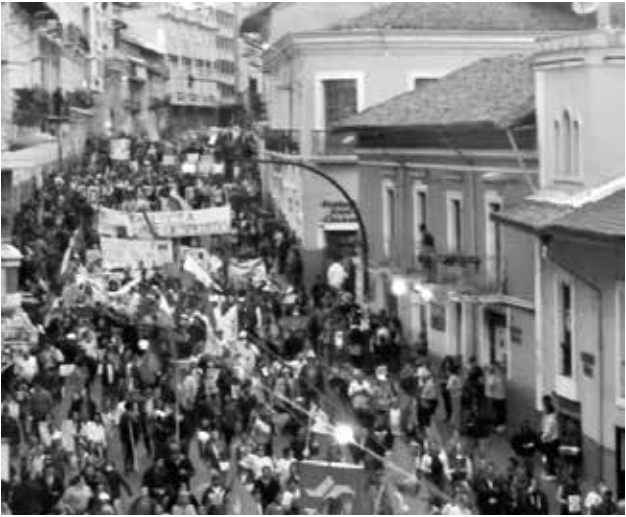
Quito, Ecuador, April 16.

Moreno has sold out to the bankers and the IMF.