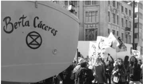
April 15–20 protest, London.

detainees held in cells for long periods. Other protests in response to the call by Extinction Rebellion were held across Europe and in India, Pakistan, Ghana, South Africa, Uganda, Mexico, Canada and many cities in the U.S. Some were huge. In Australia, protesters climbed onto train tracks and blocked a moving coal train on the way to Brisbane. No one was hurt, but arrests took place. Demanding their governments act immediately to address the environmental crises, thousands participated in sit-ins, die-ins and blockades of banks and corporate and government buildings, among other creative activities. (Read about international actions at tinyurl.com/y28z3h5s .) Greta Thunberg, 16-year-old climate activist, summed up the emergency at a London rally on April 21: “We are facing an existential crisis, the climate crisis and ecological crisis which have never been treated as crises before. They have been ignored for decades.” (The Guardian, April 21) These protests are a welcome development. But this movement needs to take aim at global capitalism, the main polluter and menace to the planet. □