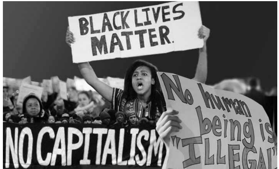
WORKERS WORLD GRAPHIC

The overwhelming majority of the people on earth welcome this enormous