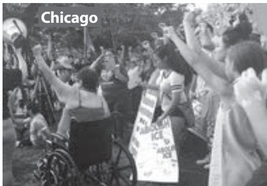
WW PHOTO: KAITLYN GRIFFITH