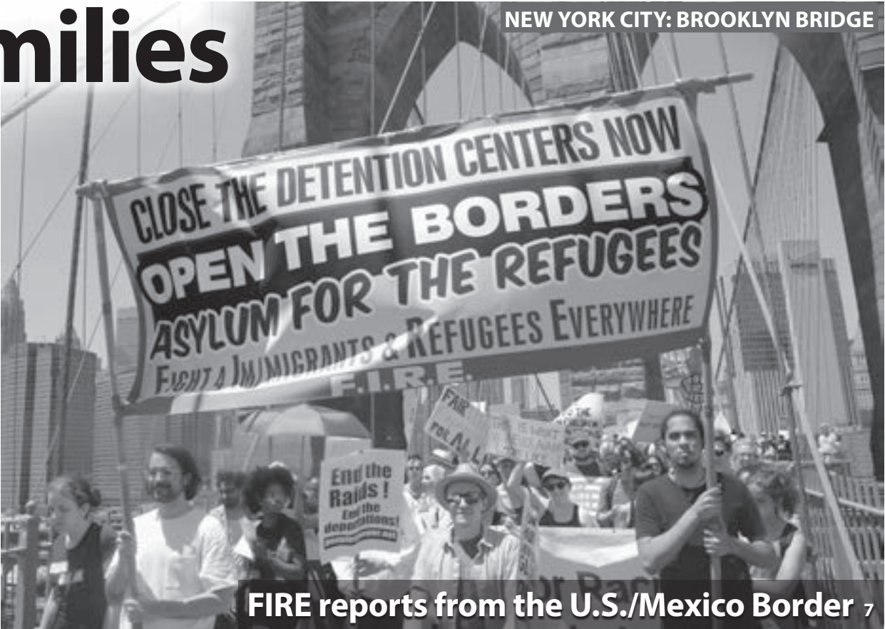
FIRE reports from the U.S./Mexico Border 7