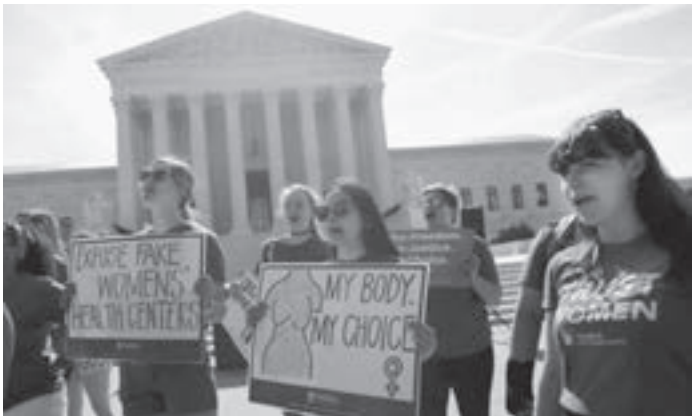
Women protest in Washington, D.C., on June 26.

According to a 2010 NARAL Pro-Choice California investigation of clinics in the state, 41 percent of counties did not have an abortion provider (that number