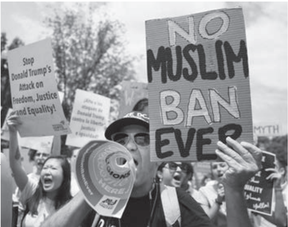
Protest of anti-Muslim travel ban decision at the U.S. Supreme Court, June 26.

“The Muslim ban is part of President Trump’s larger, un-American war on immigrant families, including his adminis-