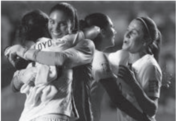
Hope Solo (second from left) celebrates a victory with teammates on the U.S. women’s national soccer team.

Solo’s recent comments struck a nerve by exposing the racist, elitist nature of U.S. soccer. Within the U.S., discrimination rules in the world’s most popular sport, while winning